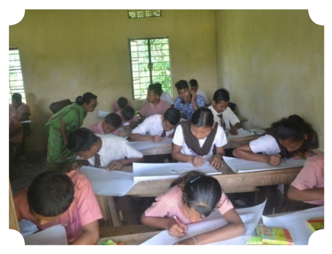
Students participating in the drawing competition.