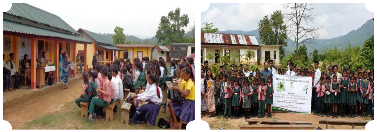
School sudents participating in IDB Nongpoh, Ri-Bhoi District.

Nongpoh (Ri-Bhoi District): IDB was celebrated at Tyrso Village on 22<sup>nd</sup> of May 2019 organised by the Divisional Forest Officer, Social Forestry Division Nongpoh. Five villages and three BMCs participated in the event. Essay writing, drawing and quiz competitions among the students were conducted. Prizes and certificates were awarded to the students who participated and 500 seedlings were distributed to the villagers for planting in their village.