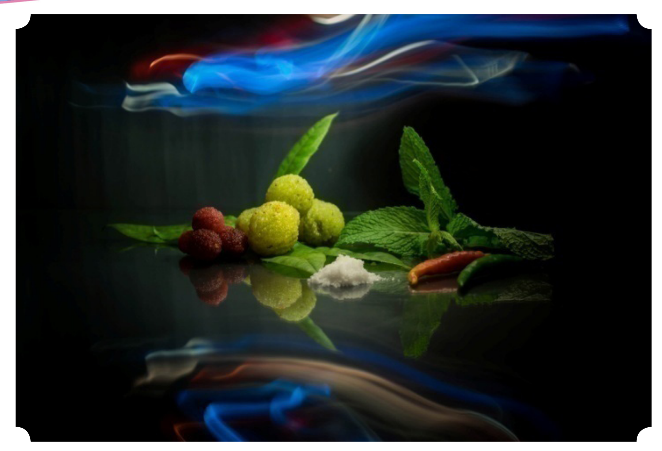
3<sup>rd</sup> Prize - Wanpynsuk Makri

Description of the Photo - Soh-Phie ( Myrica nagi ) is a seasonal fruit of Meghalaya which can be found available in the state from late month of April-May. Pudina ( Mentha sp.) cultivated through out the year and best harvested during the spring season in the state. The combination of these serve the best cuisine as chutney in Khasi food. beside they are widely use by the locals for medicinal purposes,like stomach ache gastric and others.