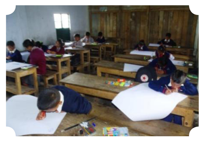
Students participating in the Drawing & Painting Competition.

South West Khasi Hills: The Office of the Divisional Forest Officer, Social Forestry Division East Khasi cum District Nodal Officer cum Convenor TSG for South West Khasi Hills observed the International Day for Biological Diversity on 24<sup>th</sup> May, 2019 at Jakrem Presbyterian Secondary School, South West Khasi Hills.