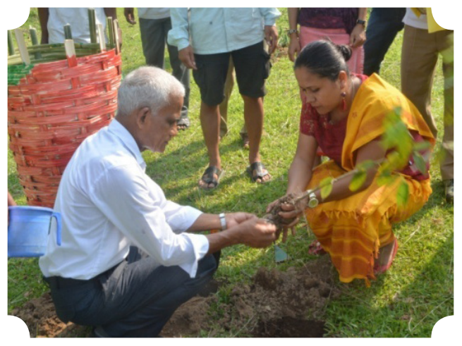
Tree plantation by the Chief Guest at the School campus.