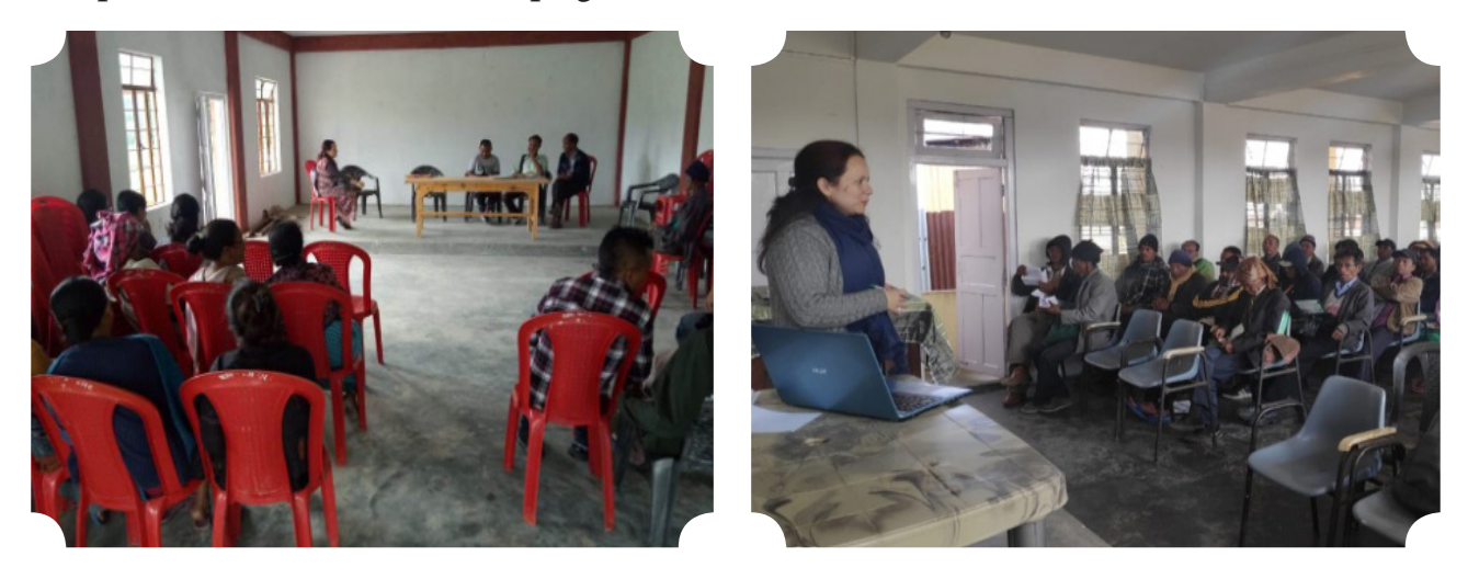
Mawkyrwat, South West Khasi Hills