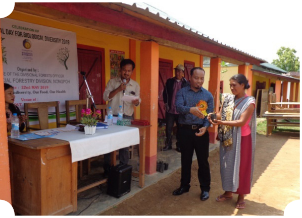
DNO, Ri-Bhoi District presenting a sapling to a villager.